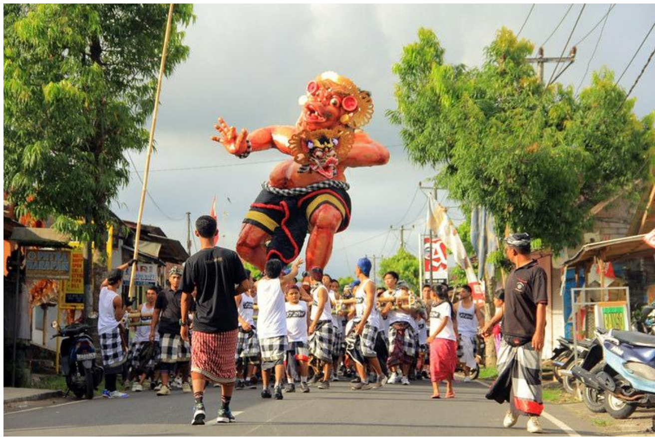
Nyepi Festival in Bali

An important Hindu holiday for the Balinese, Nyepi falls on the third day of the Balinese New Year. It is a day of silence, fasting and meditation, with all economic activities at a standstill to allow devotees to engage in self-introspection. On the eve, Ogoh-ogoh parades take place along the streets of Bali, where locals carry statues taking the form of mythological beings, accompanied by music and drama performances.