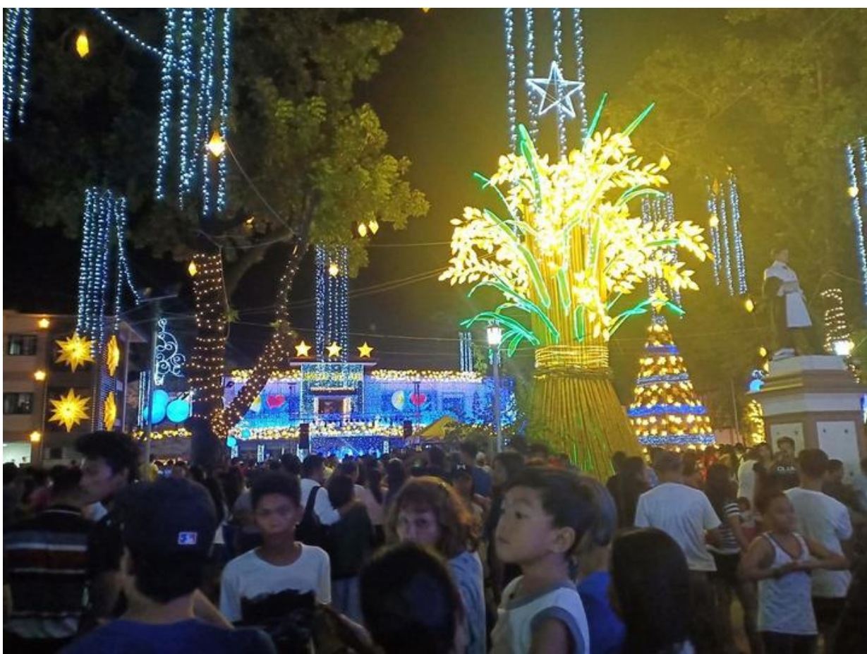
Christmas Celebration in The Philippines, 2018

With a majority Catholic population, key religious events such as Good Friday and Christmas are observed nationwide.