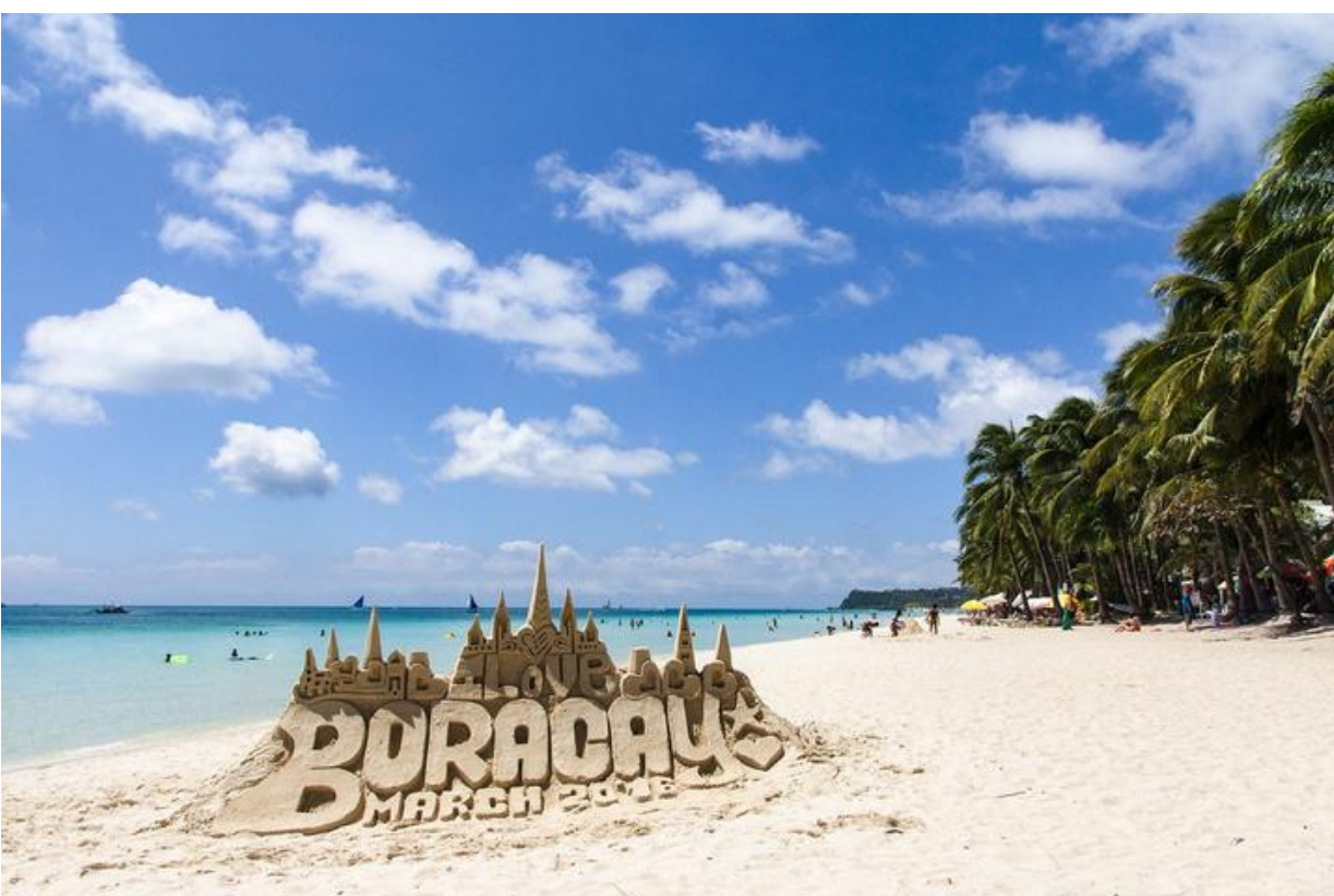
Boracay White Beach

Apart from its white sand beaches, Boracay is also famous for being one of the world's top destinations for relaxation.