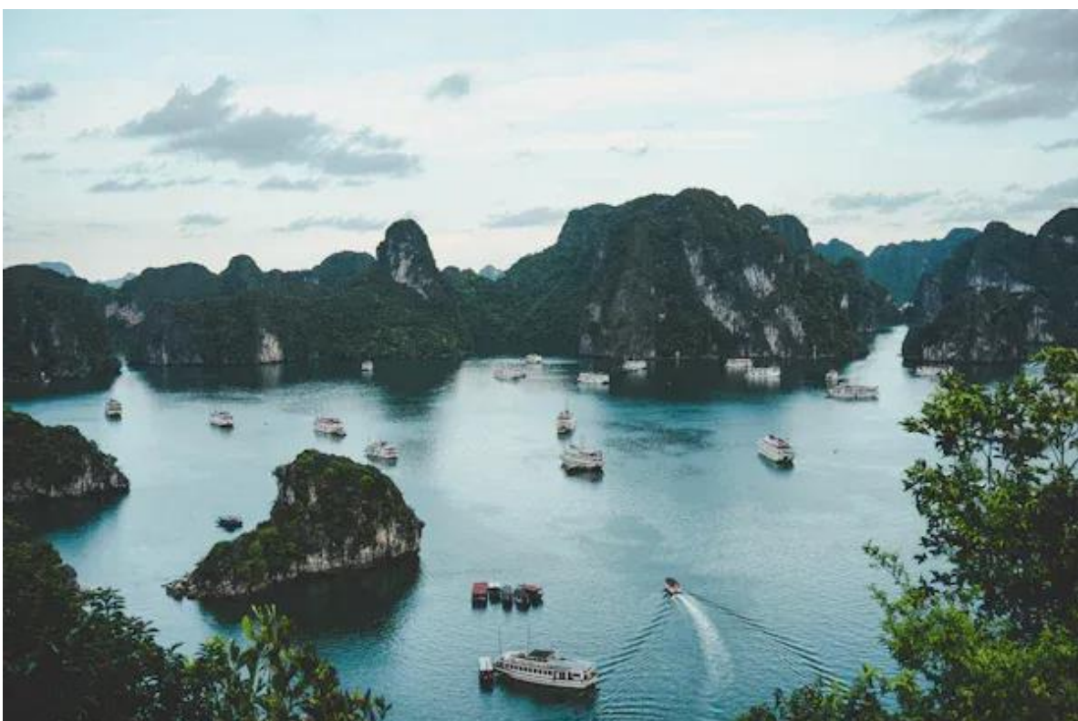
Hạ Long Bay

A UNESCO World Heritage Site and a popular travel destination, this bay features thousands of limestone karsts and isles in various shapes and sizes.