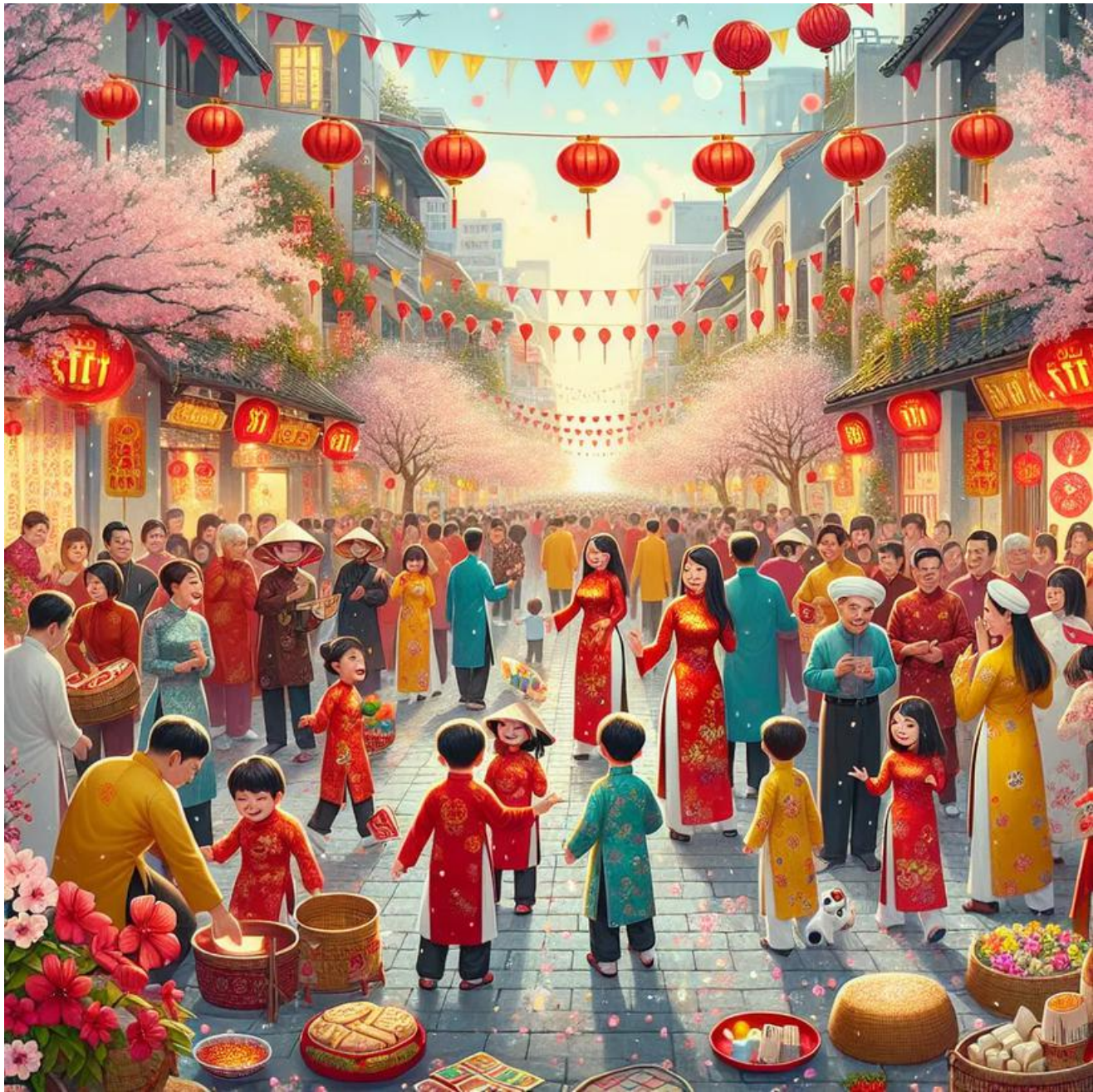
Illustration of Tet Festival, Vietnam

Located in the Bà Nà Hills resort, it provides a scenic overlook and is a major tourist attraction. The bridge loops nearly back around to itself and has 2 giant hands designed to appear like it supports the bridge.